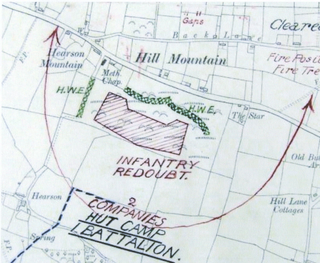
Figure 6: A site visit to the Infantry Redoubt and hut camp for 1 Battalion was undertaken

In order to assess the survival of some of the sites identified as part of the assessment and shown on the War Office map, an extract of which is shown in Figure 6, a site visit was undertaken to some of the defence line in the area around Llangwm on the north side of the Haven.