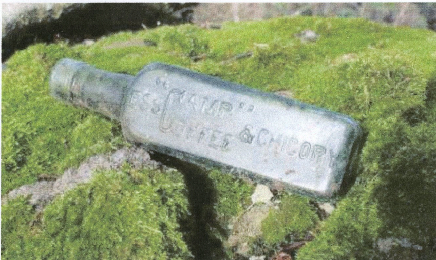
Figure 8: A 'Camp Coffee' bottle, a typical find for a First World War Camp.

No in situ remains were observed in these locations, however evidence of the hut camp was suggested in the southern perimeter of the field, where a large volume of concrete debris, brick, barbed wire and piping was observed. In addition artefactual material such as a glass bottle of "Camp" Coffee and Chicory lay amongst the debris.