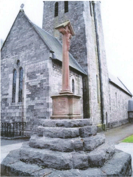
Figure 5: Pembroke Dock War Memorial, The Great War 1914-1918