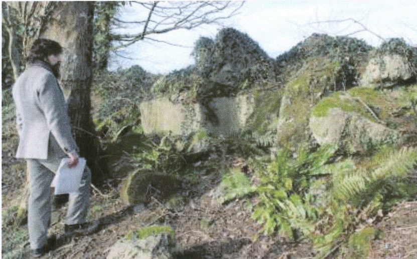
Figure 7: Ed Davies examining some of the broken up hut bases which formed part of the camp at Hearson Farm Pembrokeshire

The War Office map of 1916 shows an infantry redoubt, shaded in red, indicating it was constructed, and High Wire Entanglements and the location of a Hut Camp at Hearson Farm.